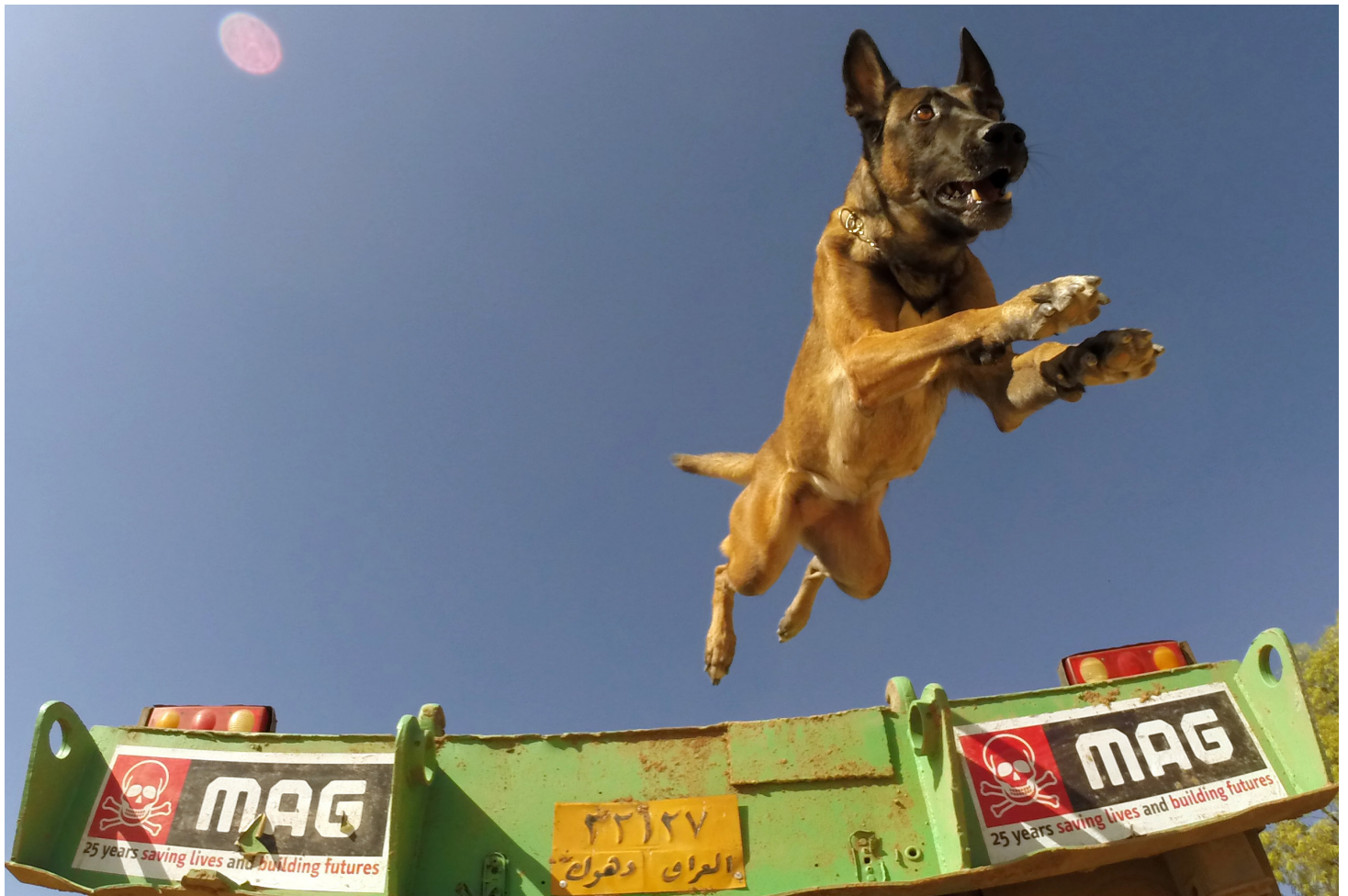
Bufty jumping off one of the MAG trucks in Iraq