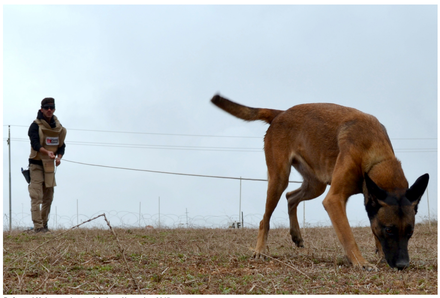
Bufty and Muhammed at work in Iraq, November 2015