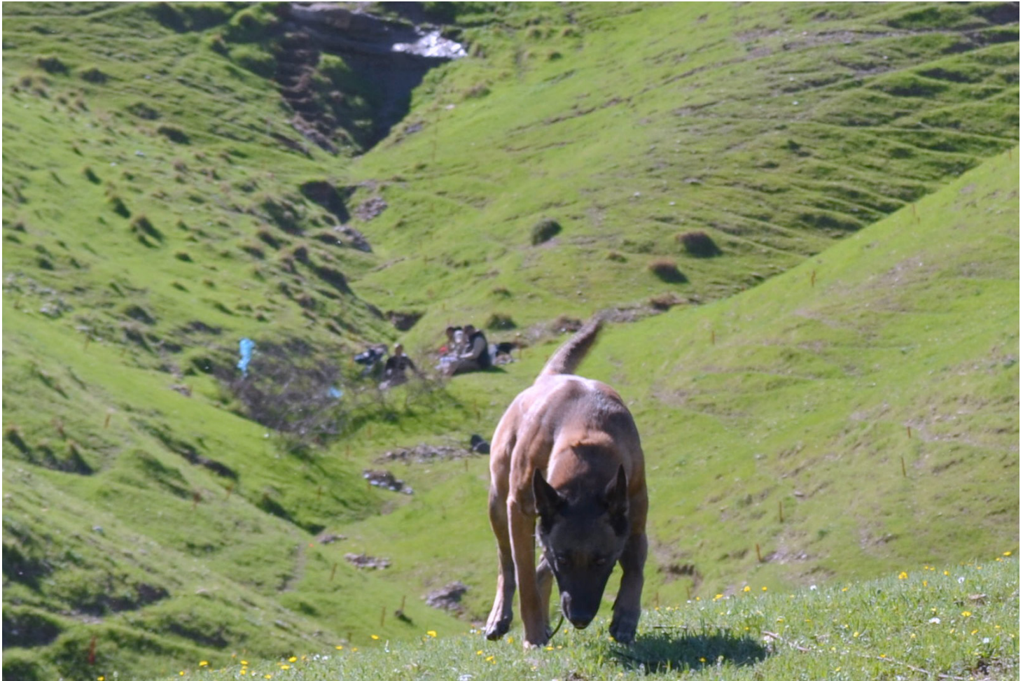
Bufty clearing land in the Kirkuk area of Iraq. The land will be used for grazing livestock by local people once clearance is finished.