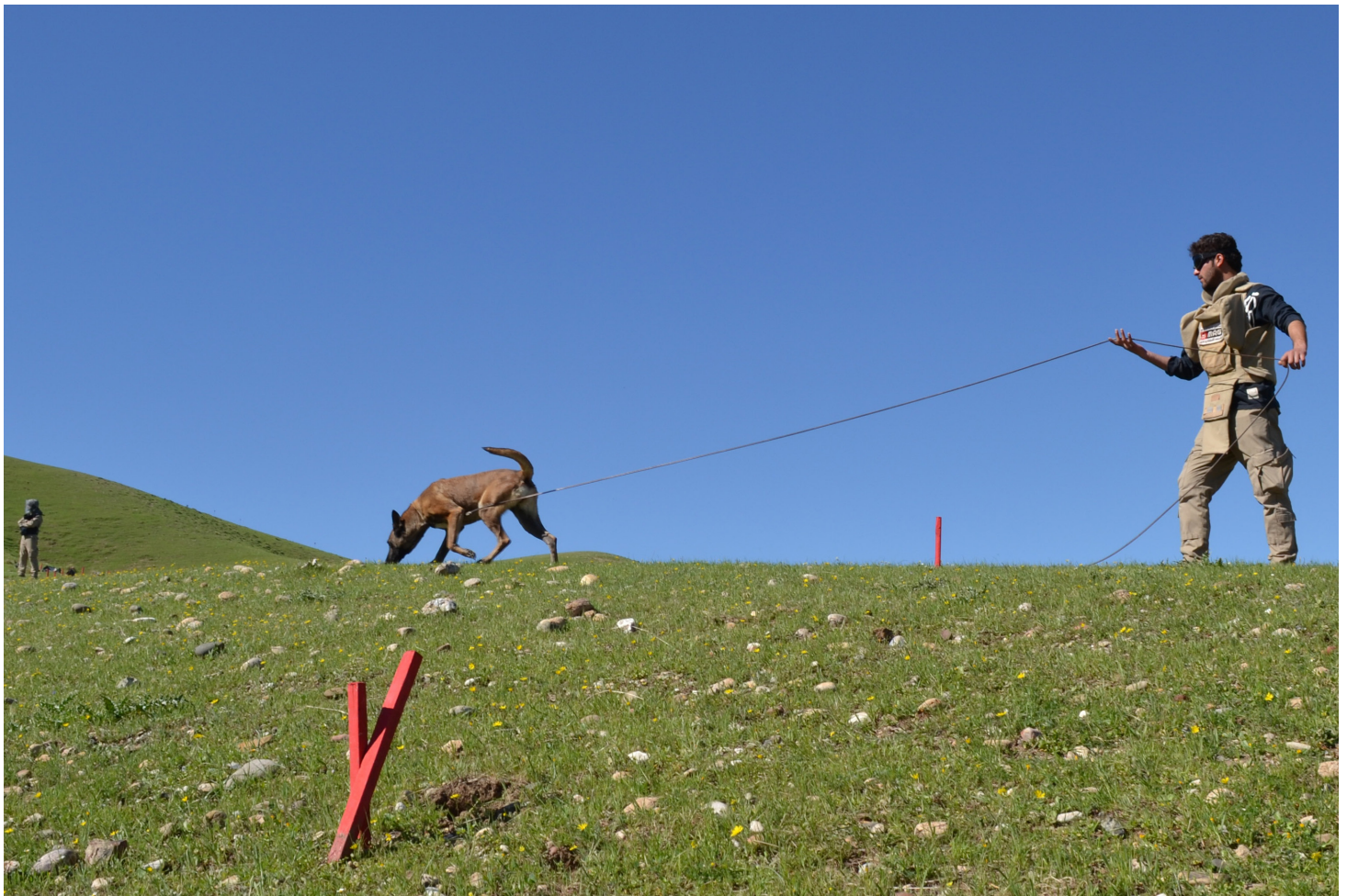
Bufty and Muhammed clearing a path through a minefield in Kirkuk. This means the deminers can walk through the minefield safely and start clearing the rest of the contaminated land.